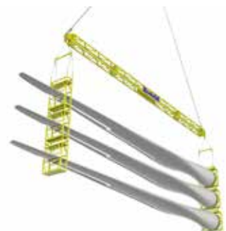
Modulift 150t x 45 mtr Lattice beam assembly