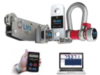
LMS Intelligent Load Measurement products