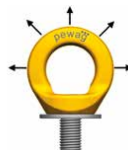
Fig. 1: Permitted directions of load that occur during correct use.

Load: Loading has only to take place in the stated direction (image 1) with the maximum number of people according to table 1 and taking into consideration the operating conditions.