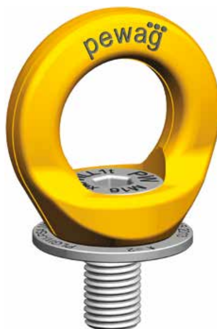
PLGWI-PSA pewag winner gamma inox anchorage point

This operating manual is valid for: PLGWI-PSA pewag winner prosecute gamma inox Anchorage point for personal fall protection