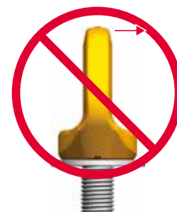
Fig. 2: Non-permitted usage